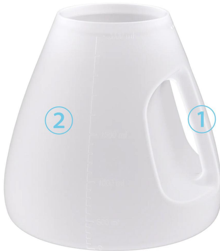
Figure 13 Urine Collection Bottle