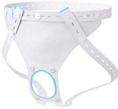
Figure 5 Female Underwear