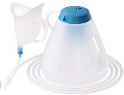
Portable Urination Device

Bring You Convenience, Reduce Your Nurse Burden, Improve Your Recovery Circumstance!