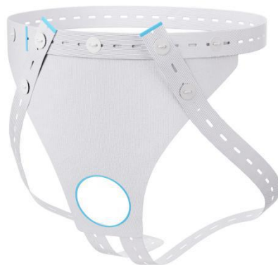
Figure 6 Male Underwear