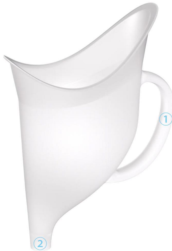
Figure 10 Handheld Urine Collection Cup