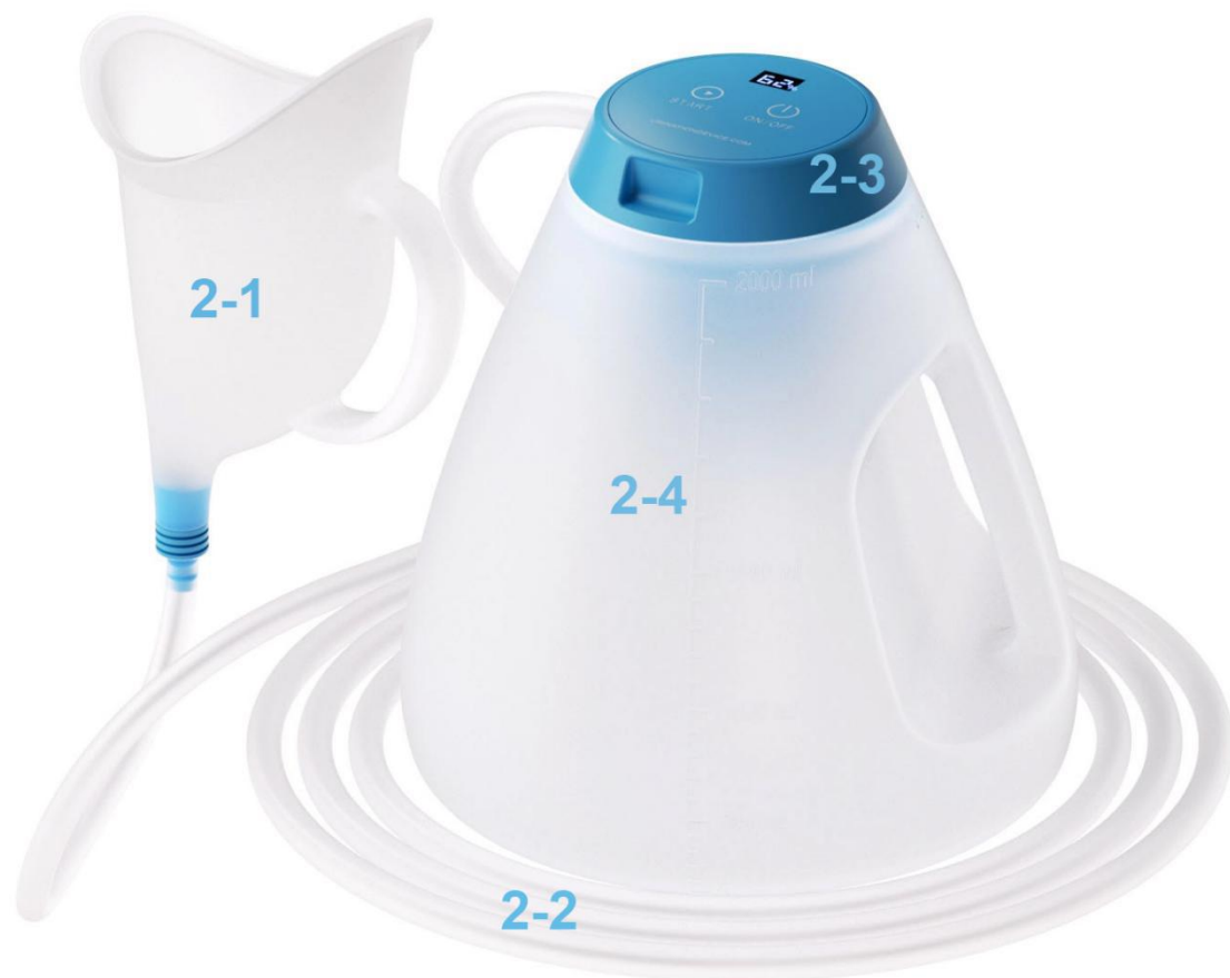
Figure 4 Portable Urination Device