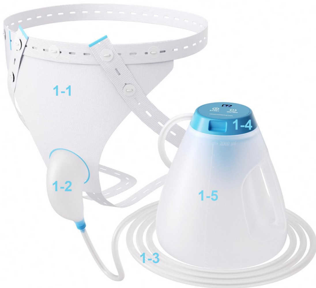
Figure 3 Male Urination Device Diagram

Take male urination device as an device diagram example