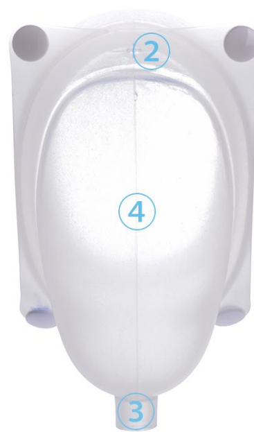
Figure 9 Female Urine Collection Cup