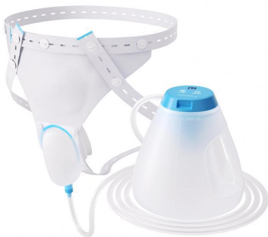
Figure 1 Female Urination Device