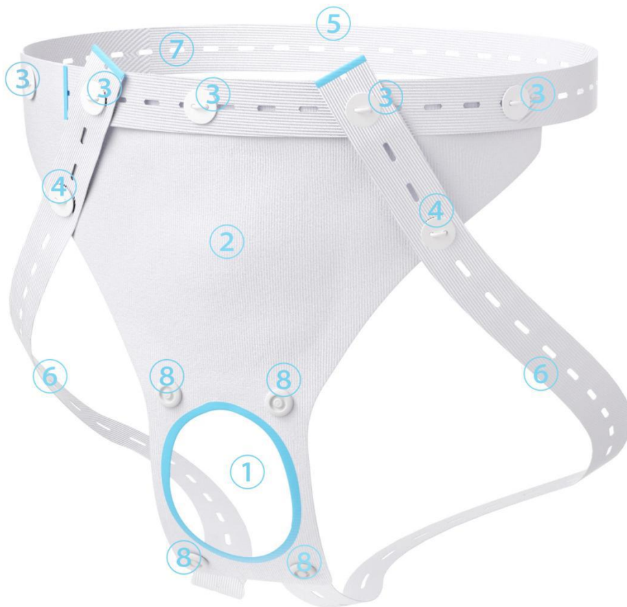
Figure 7 Female Underwear Diagram