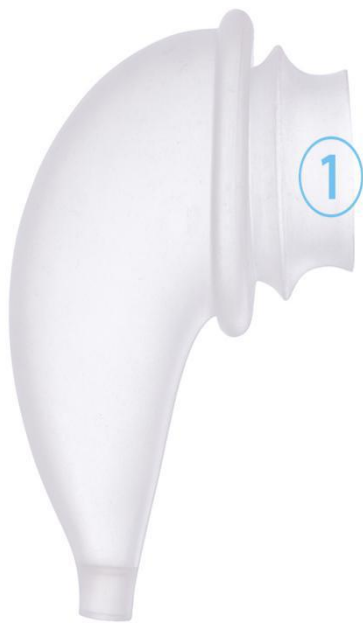
Figure 8 Male Urine Collection Cup