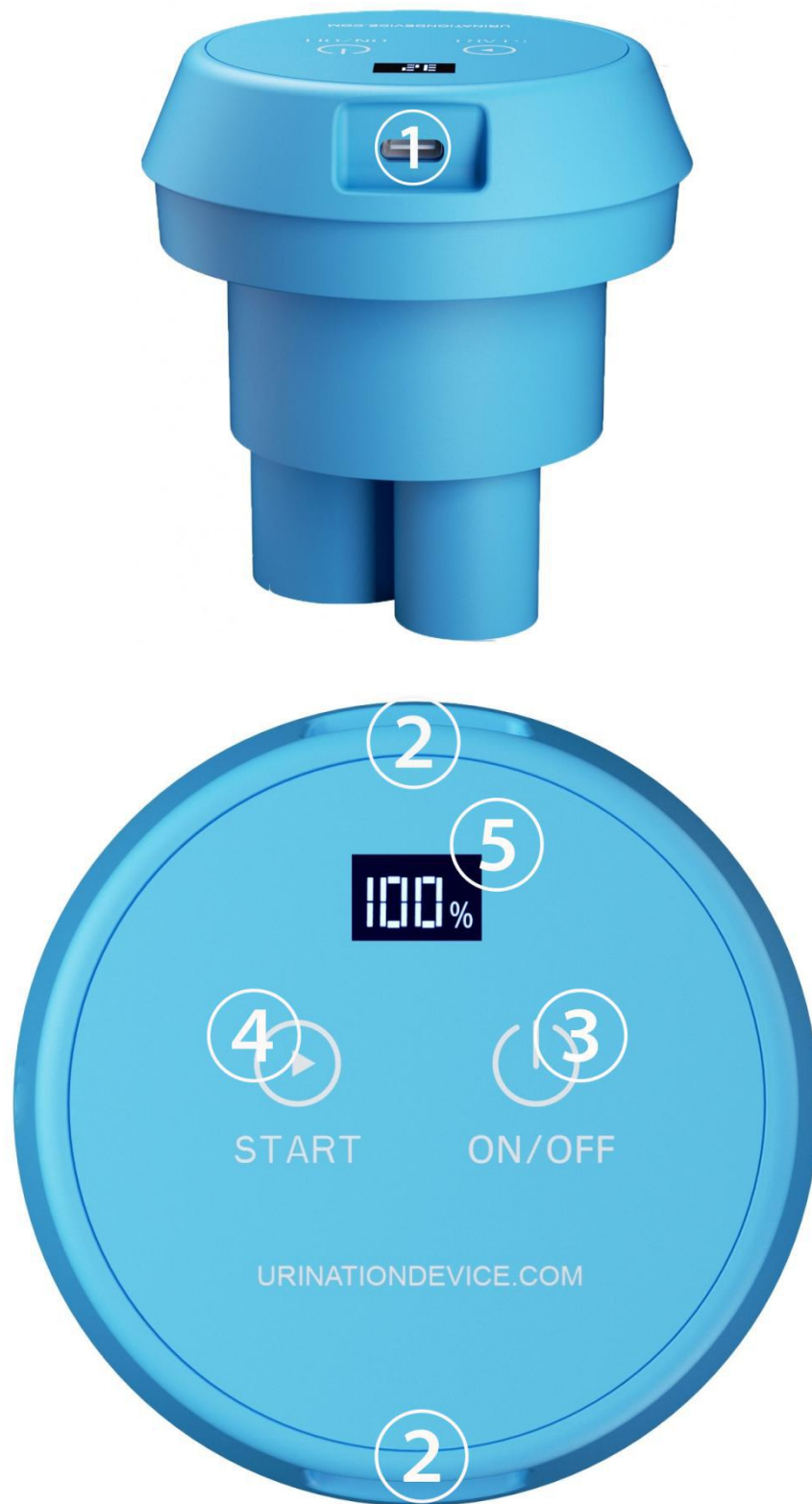
Figure 12 The Host and User Interface