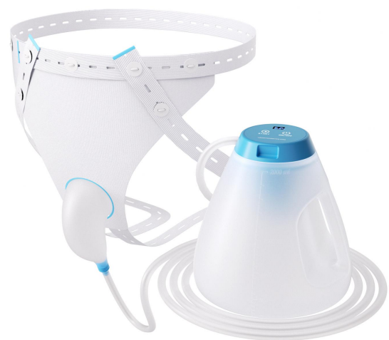
Figure 2 Male Urination Device